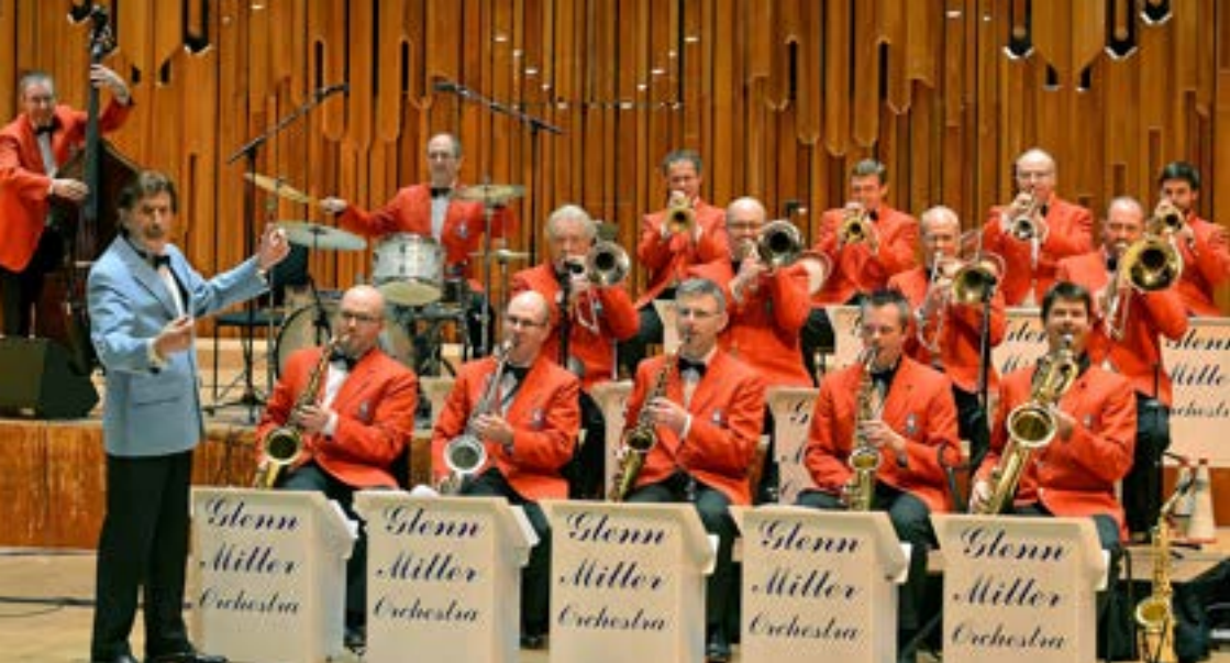
The Glenn Miller Orchestra