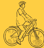
Karina Canellakis