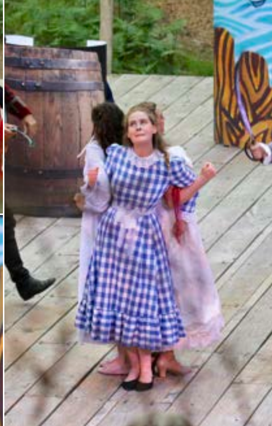
Opera Anywhere: The Pirates of Penzance