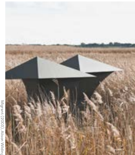
Migrant (2003), Alison Wilding

Snape Maltings, Free – no ticket required The Red House, Aldeburgh £11 Under 18s free Concessions are available