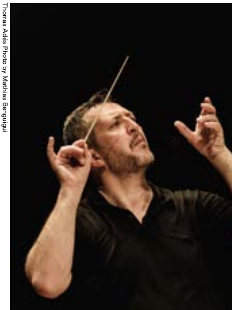
Thomas Adès