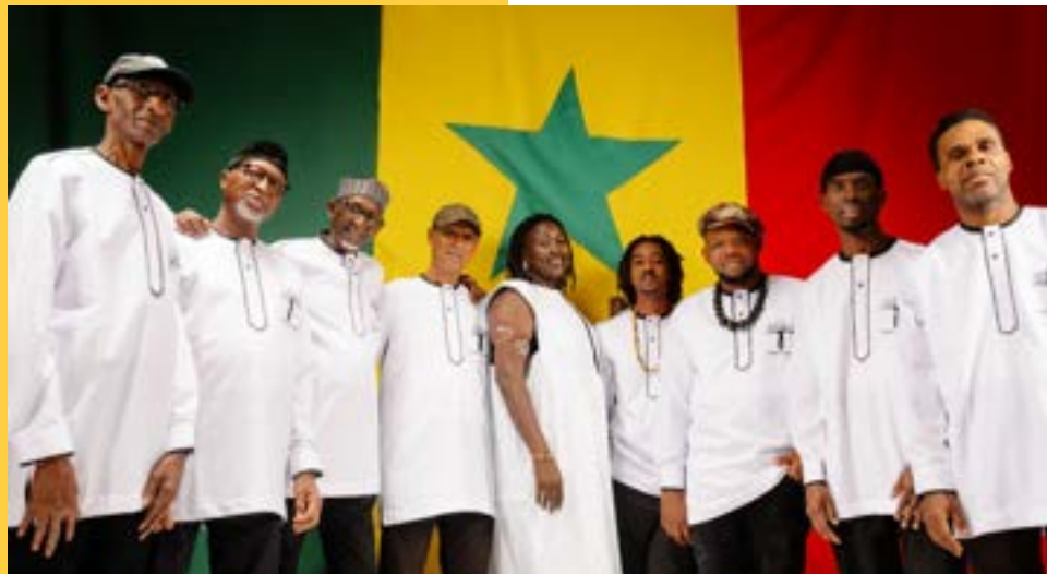
Orchestra Baobab