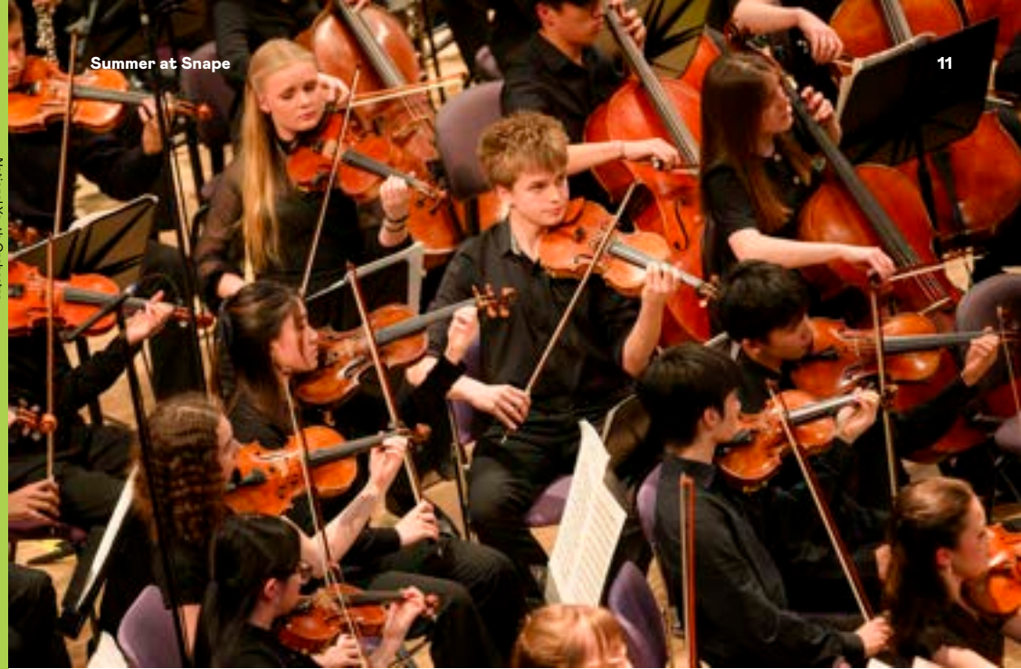
National Youth Orchestra

Info and booking: brittenpearsarts.org 01728 687110