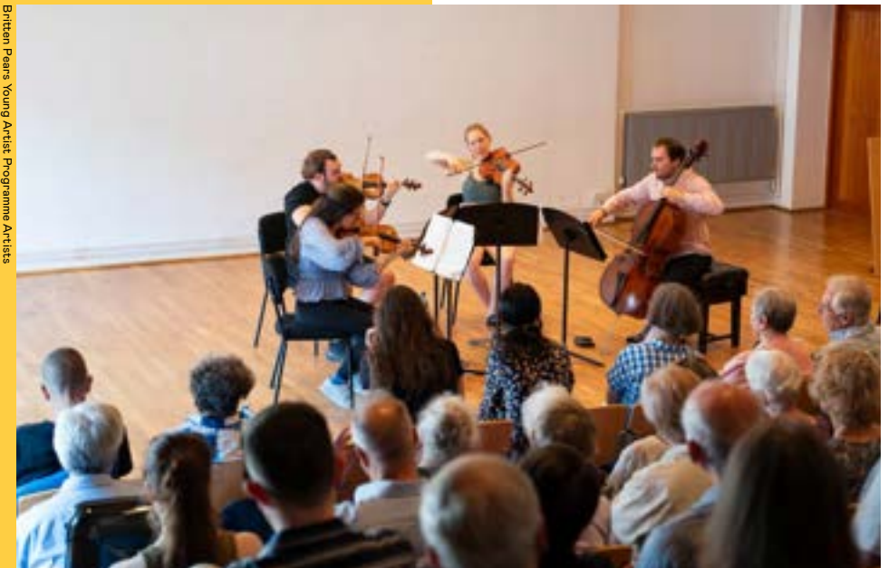
Britten Pears Young Artist Programme Artists