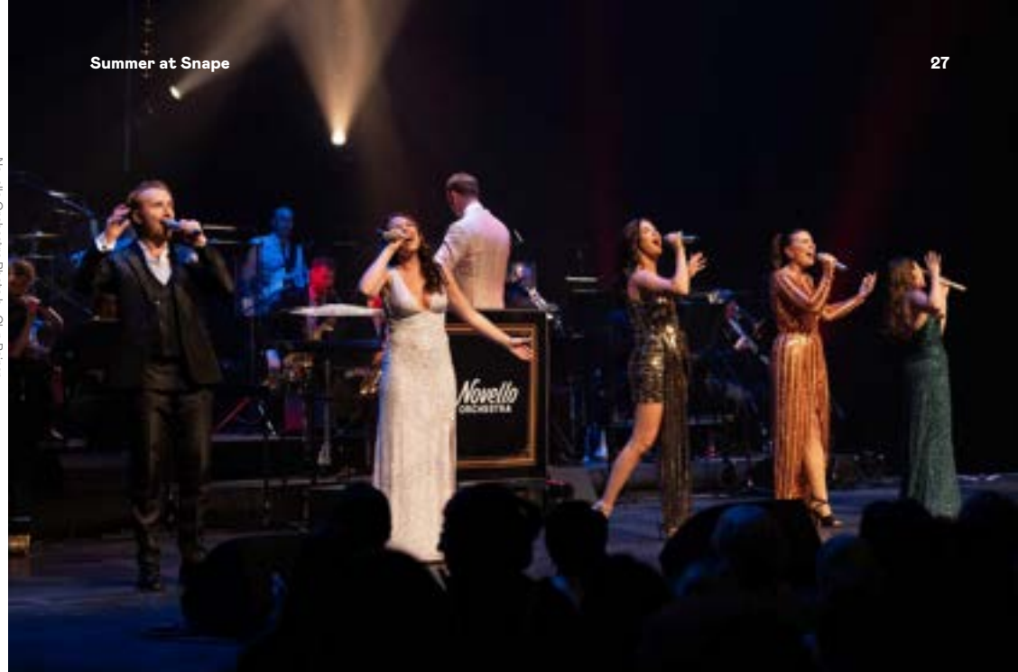
Novello Orchestra