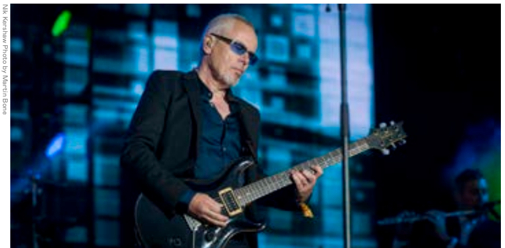
Nik Kershaw