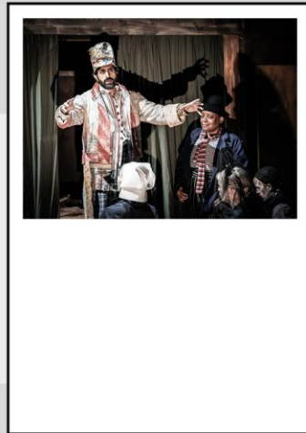
W: 154mm x H: 103mm Option 2