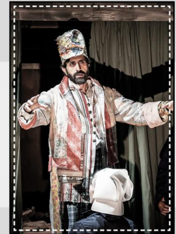
W: 175mm x H: 241mm Option 2 This is the finished page size 3mm bleed is required on all edges