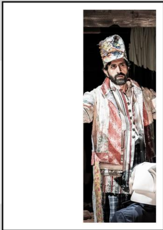
W: 74.5mm x H: 210mm Option 1